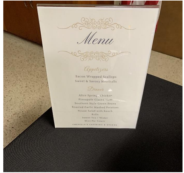
Fellowship Lodge No. 84 Table Lodge