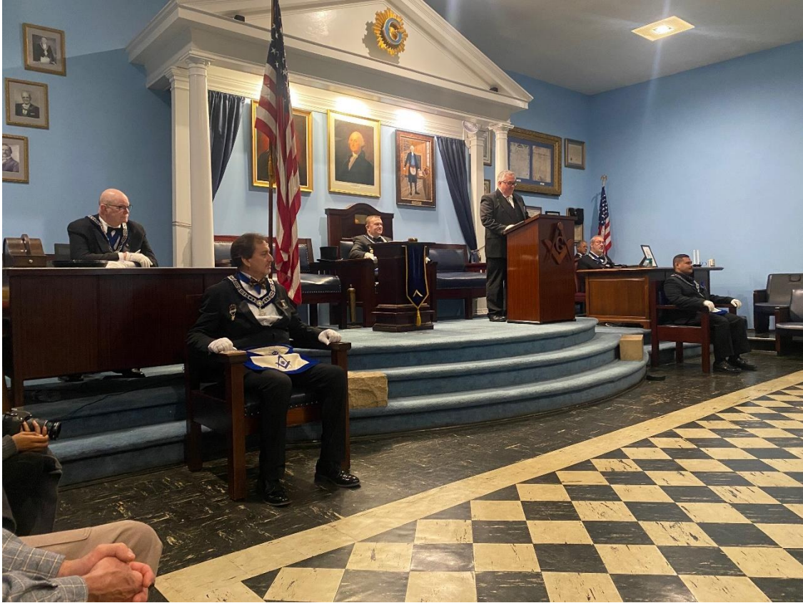
Some pictures from our Lodge installation on Dec. 21, 2024