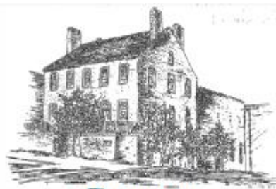
Fredericksburg Masonic Museum Association, Inc.

Please consider sponsoring a hole, donating prizes, or registering a foursome. The Lodge Building and Cemetery are both in need of repair, so please consider helping out as well as enjoying a great day of fun and fellowship.