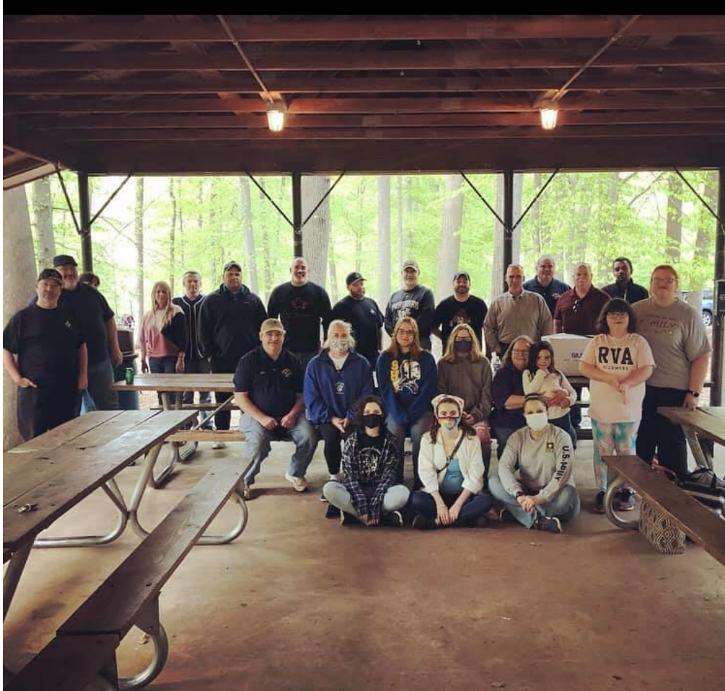
Lodge cookout at Alum Springs Park on April 25 th