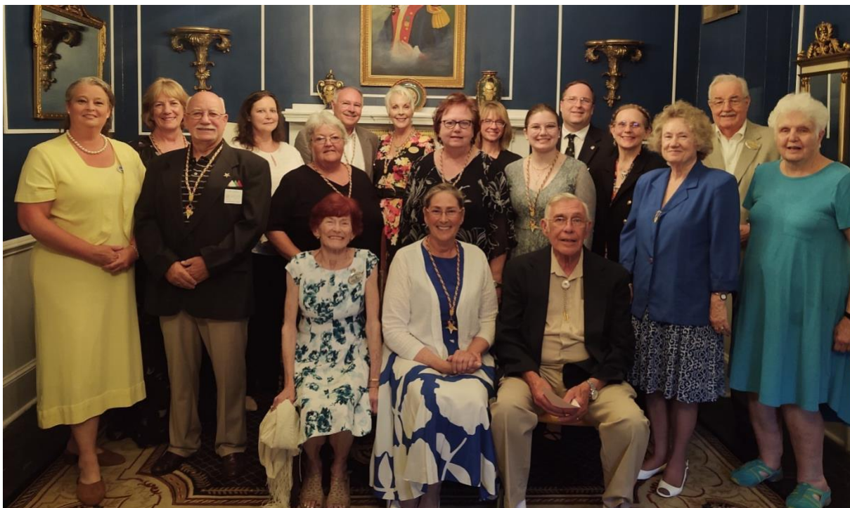
Congratulations and a hearty welcome back to the members of OES Chapter No. 29, as they resume in-person meetings at the Fredericksburg Masonic Temple! Picture taken in the new Lafayette Room.