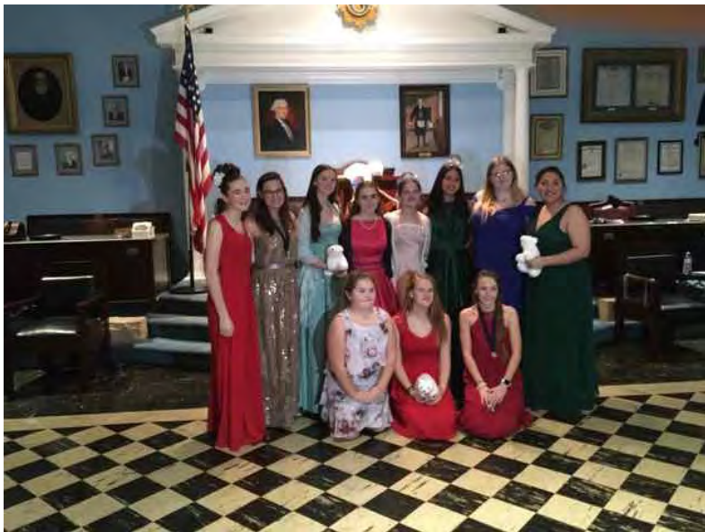
Fredericksburg Assembly #12 International Order of Rainbow Girls