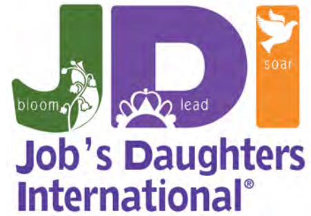
Bethel #16 JOBS Daughters International